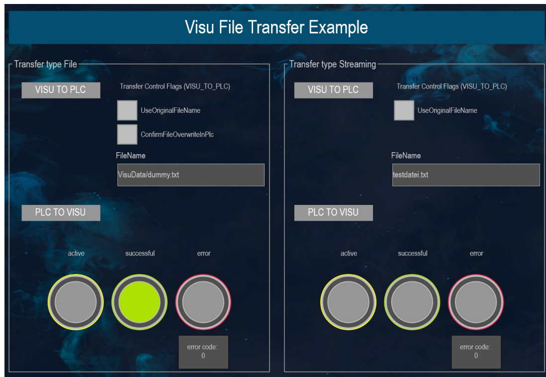
Visualization: Operating panel